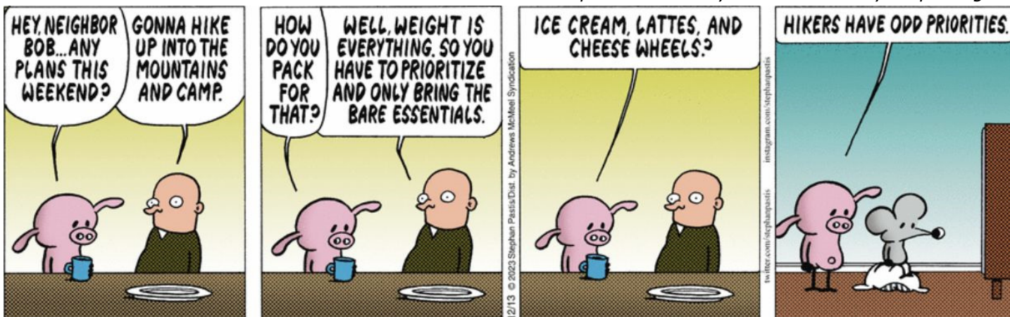
Reprinted courtesy of "Pearls Before Swine" by Stephan Pastis.