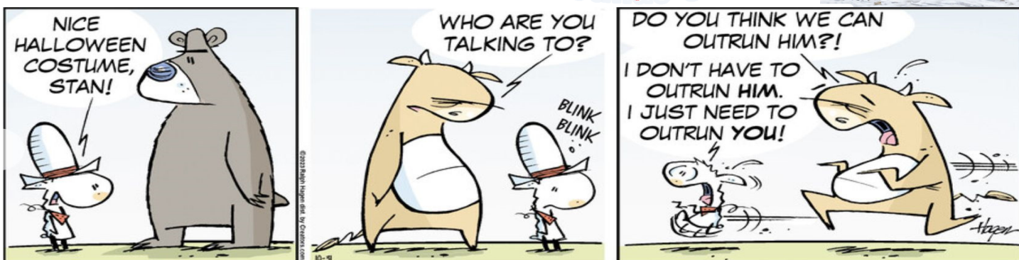
Reprinted courtesy of "The Barn" by Ralph Hagen.