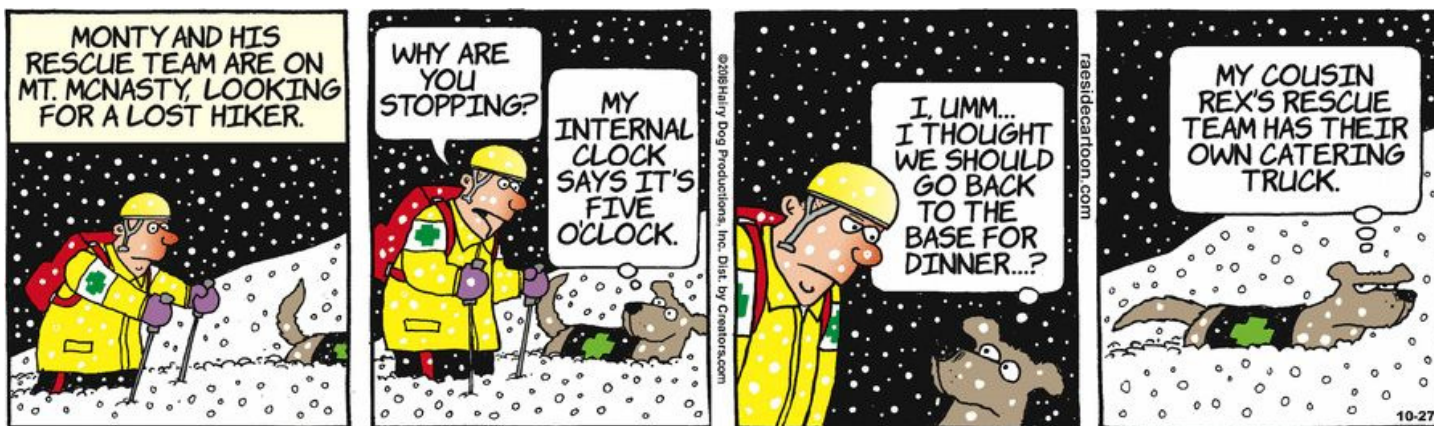
Reprinted courtesy of "The Other Coast" by Hairy Dogs.